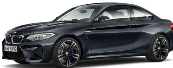
B39 Mineral Grey