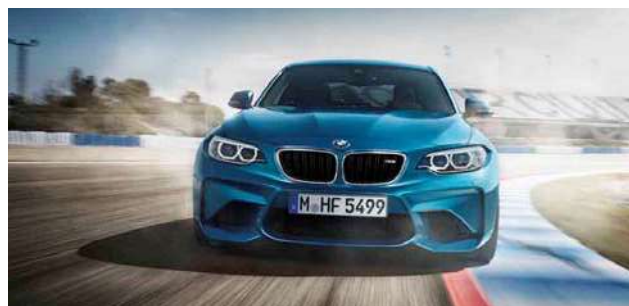
BMW M2 Coupé