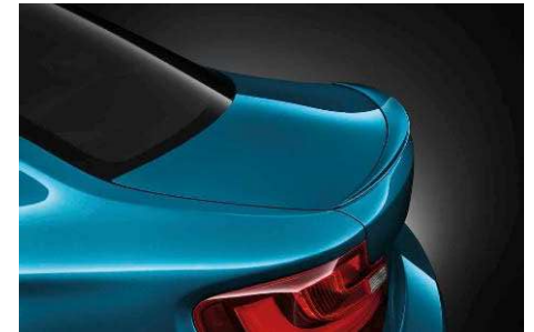
M rear spoiler