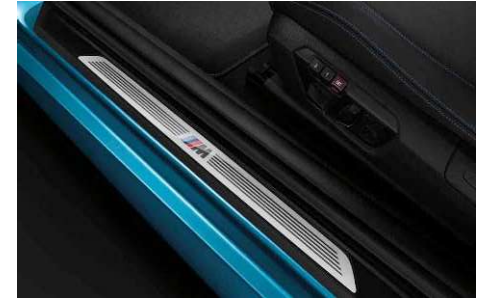
M entry sills