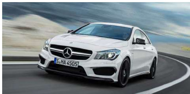
MB CLA 45 AMG