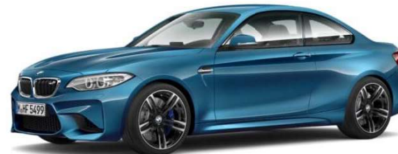
C16 Long Beach Blue