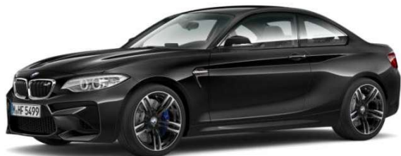
475 Black Sapphire