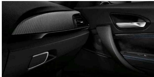
Carbon fibre door trims