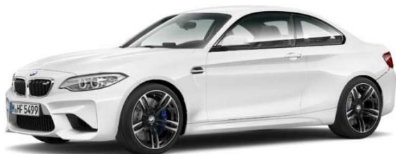
300 Alpine White