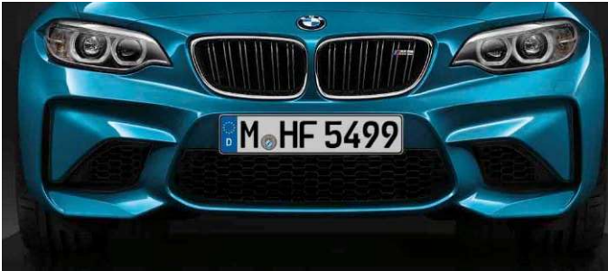
Three part air intake and M kidney grille