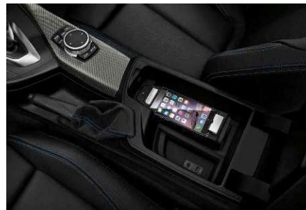
M contrast stitching and Bluetooth hands-free facility