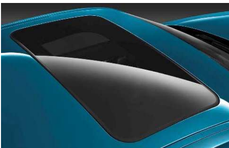
Glass sun roof