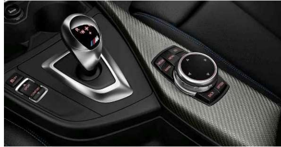
M center console