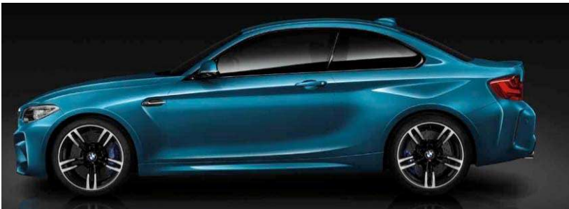
M side skirt