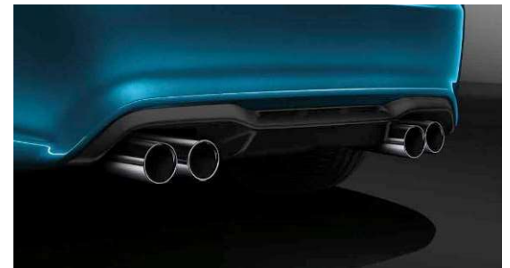
High-gloss double tailpipes