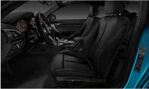
M sport seats