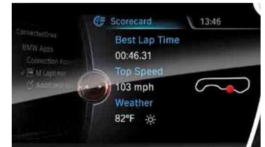
M Laptimer App